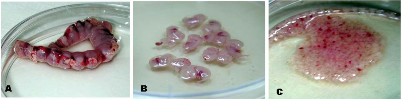
Fig 1. Preparation of MEF. (A) Mice uterine horns. (B) Released embryos. (C) Resultant mash after thorough mincing of the embryos.